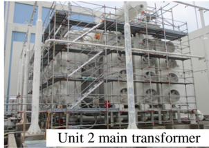
Unit 2 main transformer